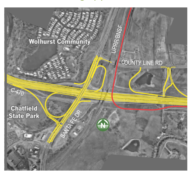
Figure 2-31 Southwest-Northeast Partial Cloverleaf Interchange (a) Alternative

bound to eastbound and northbound to westbound C-470 traffic, as shown in Figure 2-32. To get the northeast loop to meet design standards and fit between Santa Fe Drive mainline and the railroads, the Santa Fe Drive alignment was shifted to the west, closer to the Wolhurst Community. This alternative was eliminated due to potential effects to the Wolhurst Community, and a lack of a direct connection from C-470 to Santa Fe Drive, as with the Partial Cloverleaf Interchange (a) Alternative.