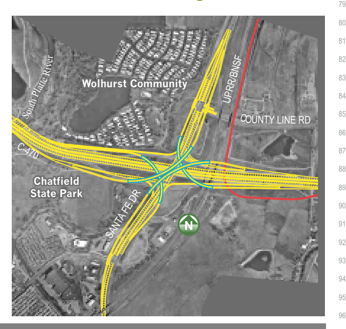
Figure 2-35 Directional Interchange Alternative

As a function of express lanes access at the I-25 interchange, seven alternatives were developed